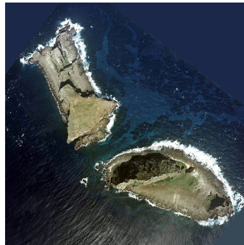
Kitakojima and Minamikojima Islands from the Senkaku Island.

import checks), less favorable conditions for Japanese investments, or boycott on tourism. There are signs that all these actions have partially begun. Most recently, it was suddenly announced that key Chinese banks were cancelling their participation to the annual meeting of the World Bank and IMF (scheduled to take place in Tokyo this year on Oct 9-14). This seems part of a growing series of cancellations of Sino-Japanese events. 17 China is aware that sanctions against a key economic partner are very difficult to operationalize in the globalized economy. But the fact is that a great range of actions are being considered, even actions that would be costly for China.