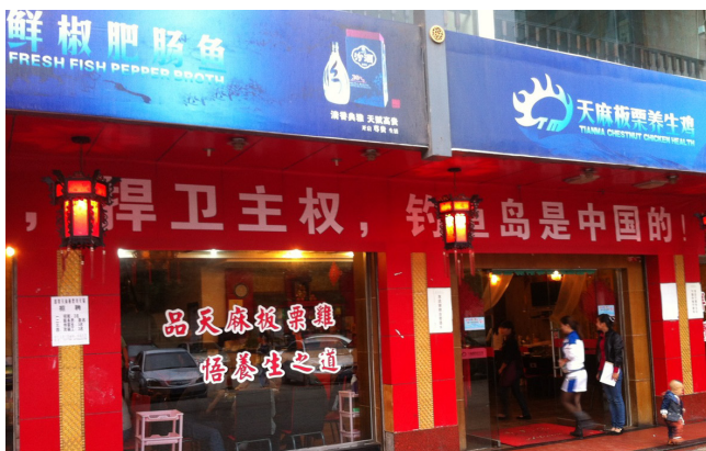
"Defend sovereignty, Diaoyu Islands belong to China."