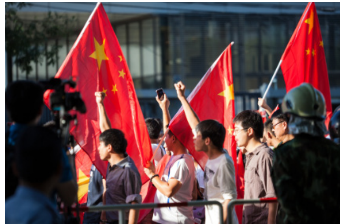
Beijing Protest

In light of these events, the September 11, 2012 nationalization of the Diaoyus/ Senkakus possibly as a response by Japan's PM Noda to the 2010 crisis (when Japan lost face) is viewed by China as a significant and further attempt to alter the agreed upon status quo. PM Noda made the case that nationalization was a better outcome than a takeover by the Tokyo government under rightwing leader Ishihara, thus akin to retaining the status quo, the Chinese do not accept this argument. In the first place, Noda is not trusted in light of his past statements against the Tokyo Tribunal outcomes, on the war, and on comfort women. Chinese leaders see him as partially connected to the likes of Ishihara in his outlook on history and relations with China.