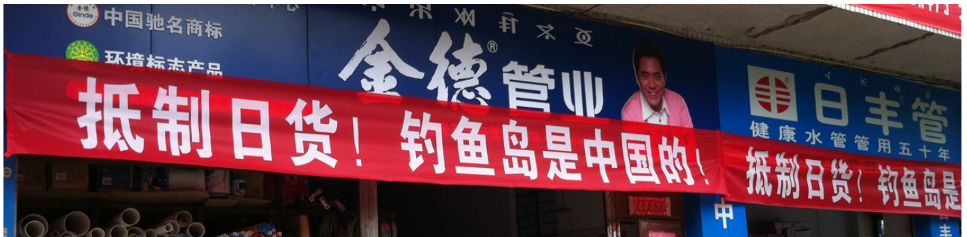
Red banner indicates "Boycott Japanese Products! Diaoyu Islands belong to China!"