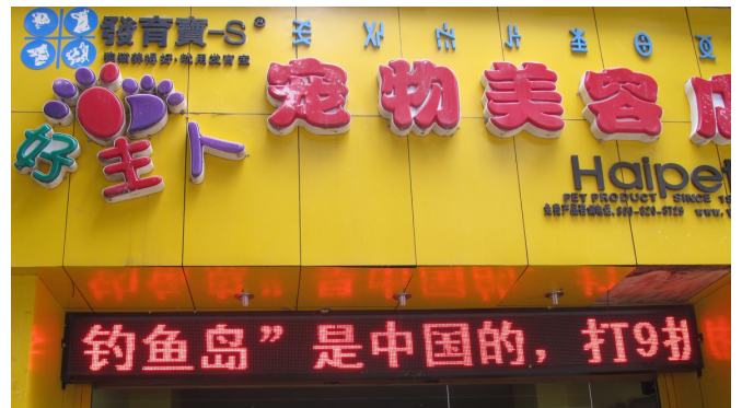
Sign at pet store reads "If customers shout 'Diaoyu Islands belong to China' will be given a 10% discount."