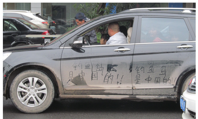
"Diaoyu Islands belong to China."

political behavior and eagerly participate. Finally, it must be said that anti-Japan protests have sometimes become vectors for larger frustrations against economic inequality, against the growing arrogance of the rich class toward the common people, toward corruption and toward a sense of weaker governance in the waning days of the Hu/Wen regime.