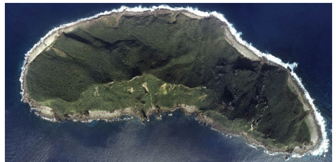
One of the Senkaku Islands - Uotsuri.

Thus, while there are grey areas, China asserts that it has a relatively strong historical claim, while Japan claims a lengthy de facto occupation between 1895 and 1945 and since 1971, and inconsistent expression of the Chinese counter-claim (not much expressed between 1945 and 1971 in particular).