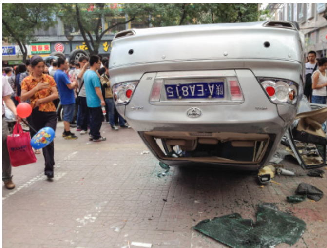
Japanese Brand Cars Overturned in China Diaoyu Protests

Given the general ignorance of the other side's facts and positions and weak regional institutions, the negative cycle of strategic interactions between Japan and China has created a volatile situation. As leaders in both countries consider their domestic audience in a context of domestic uncertainty and very short time frames for leadership survival (including China in 2012), they end up locking themselves in vicious signaling games. Every signal given by one leader to domestic audiences (in an effort to win points over fierce political competitors) is seen by the other country as a signal of aggression and conflict, forcing the leader of that country to signal back to his own domestic audience through intensified responses. The US could have played a more active role in mitigating the crisis, including attempting to dissuade Japan from taking its first move, knowing how it would be interpreted on the China side. But the US is too involved in its own pre-election political climate to wade into such treacherous waters.