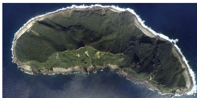
One of the Senkaku Islands - Uotsuri.

Thus, while there are grey areas, China asserts that it has a relatively strong historical claim, while Japan claims a lengthy de facto occupation between 1895 and 1945 and since 1971, and inconsistent expression of the Chinese counter-claim (not much expressed between 1945 and 1971 in particular).