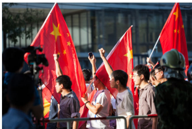
Beijing Protest

In light of these events, the September 11, 2012 nationalization of the Diaoyus/ Senkakus possibly as a response by Japan's PM Noda to the 2010 crisis (when Japan lost face) is viewed by China as a significant and further attempt to alter the agreed upon status quo. PM Noda made the case that nationalization was a better outcome than a takeover by the Tokyo government under rightwing leader Ishihara, thus akin to retaining the status quo, the Chinese do not accept this argument. In the first place, Noda is not trusted in light of his past statements against the Tokyo Tribunal outcomes, on the war, and on comfort women. Chinese leaders see him as partially connected to the likes of Ishihara in his outlook on history and relations with China.