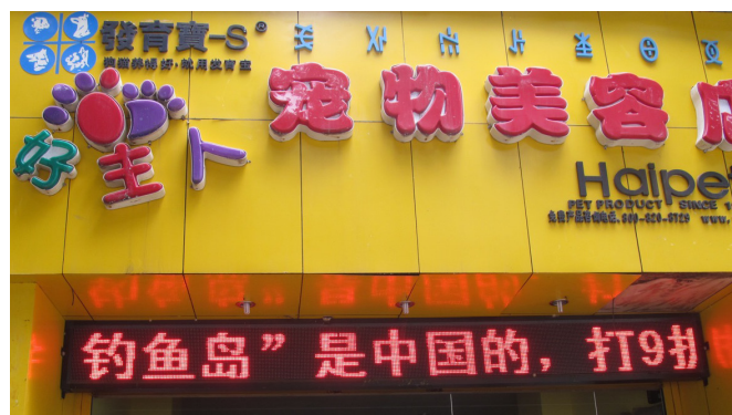
Sign at pet store reads "If customers shout 'Diaoyu Islands belong to China' will be given a 10% discount."