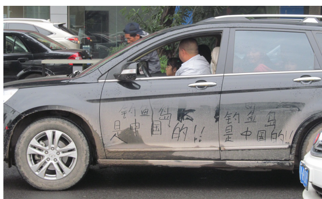
"Diaoyu Islands belong to China."

political behavior and eagerly participate. Finally, it must be said that anti-Japan protests have sometimes become vectors for larger frustrations against economic inequality, against the growing arrogance of the rich class toward the common people, toward corruption and toward a sense of weaker governance in the waning days of the Hu/Wen regime.