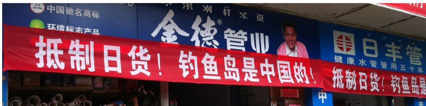
Red banner indicates "Boycott Japanese Products! Diaoyu Islands belong to China!"