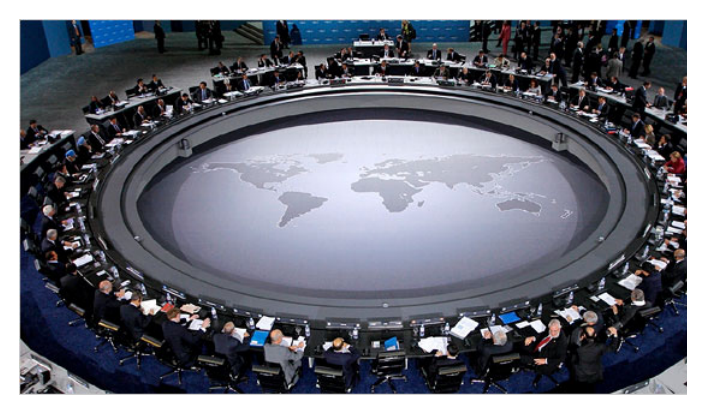
Participants at the Pittsburgh Summit.

The Sherpas of Troika countries would obviously remain in close contact with the Sherpas of the US and China – who de facto could be ex-officio members of the Troika directing the work of the "non-