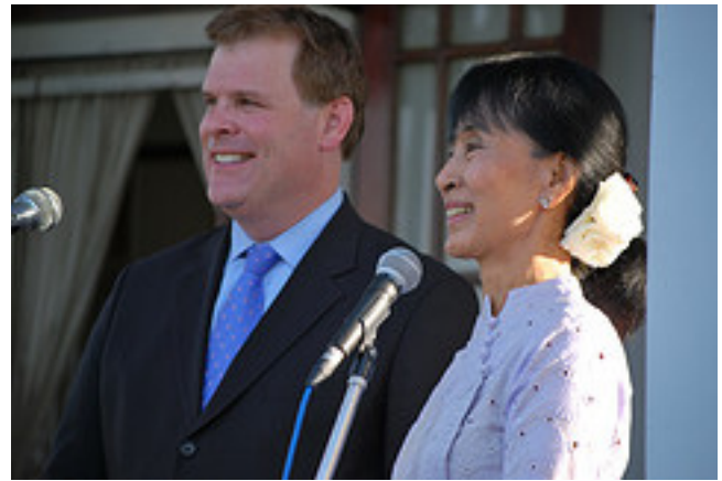
Minister of Foreign Affairs John Baird meeting with Aung San Suu Kyi

So with the door ajar, the question now is how is Ottawa going to capitalize on this opportunity (indeed, one could argue “responsibility”) to “advance Canadian values” with policies to promote positive change for the people of Burma. Little movement can be discerned to date. The result of our isolation from Burma over the last years is that we find ourselves with few connections within Burmese society and a relative lack of knowledge as to whom to work with and where to commit our limited resources. Our policies have