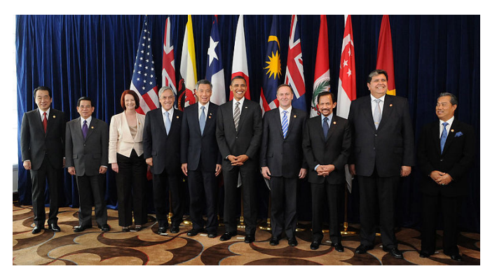
Leaders from member states of TPP in 2010

The TPP has not been easy to negotiate. It has 29 chapters and seeks to establish disciplines in some new areas, including e-commerce and data flows. It includes services, trade facilitation, intellectual property rights and investment and focuses as much on "behind the border" measures as it does on barriers at the border. It has gone through 20 formal rounds of discussion in addition to a number of intercessional meetings, all of which have been made more complex by the late arrival of new entrants such as Mexico, Canada and now Japan.